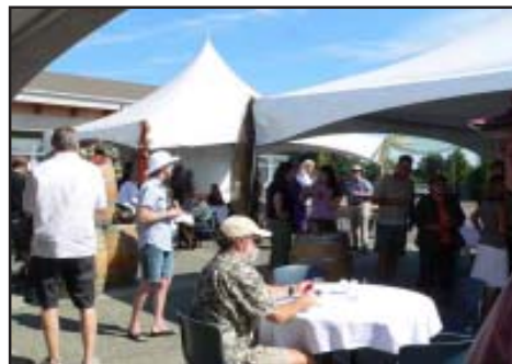
Wine, food and sunshine Saturday afternoon!