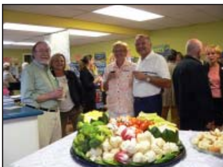
Members and volunteers networked and enjoyed veggie and cheese trays generously provided by Thrifty Foods Sidney - many thanks!