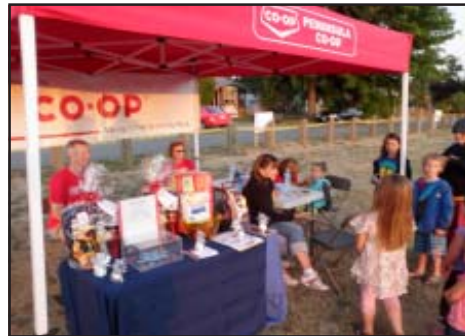
Peninsula Co-op face-paints popular with the kids