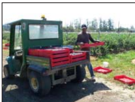
The pick of the organic crop at Ruby Red Blueberry Farm.