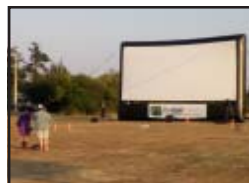
Giant 3 storey screen inflated and ready to go!