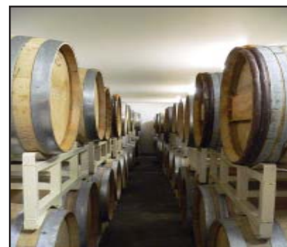
Wine by the barrel at Muse Winery